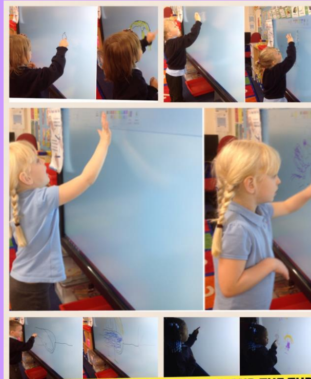
USING PAINT TO DRAW GOLDILOCKS AND THE THREE BEARS