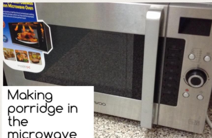
Making porridge in the microwave